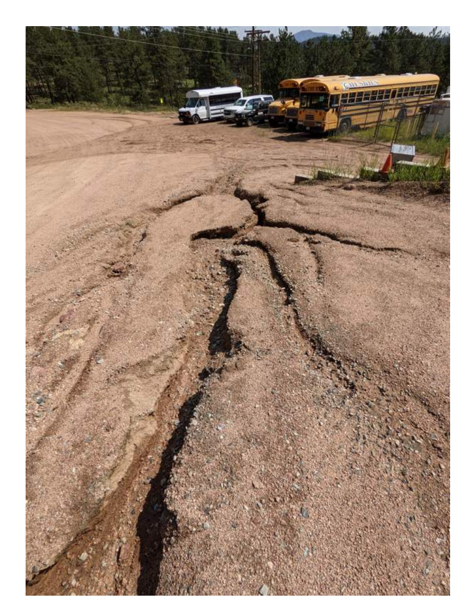
WASH OUT CONDITIONS