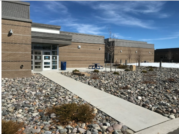
Replace settling sidewalks