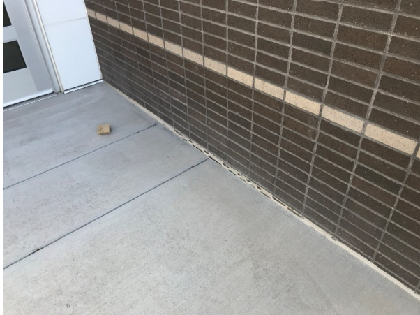
Recaulk at sidewalks and next to the building