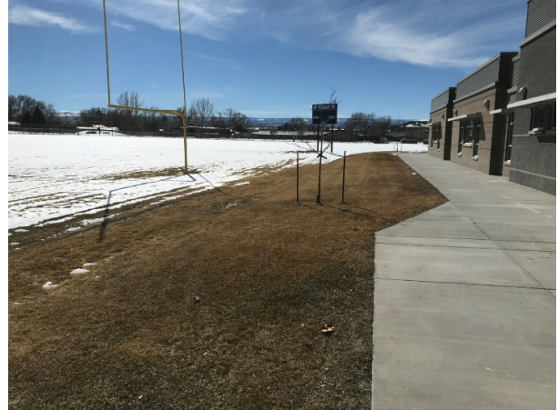
Adjust sprinklers on south side that are spraying against the building