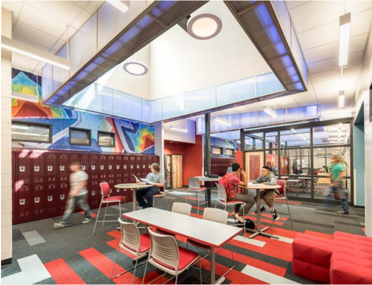
Caption: RTA's use of large scale graphics of ceremonial costumes, Southwest color, pattern, and sacred geometries respect and honor Ignacio's multi-cultural heritage