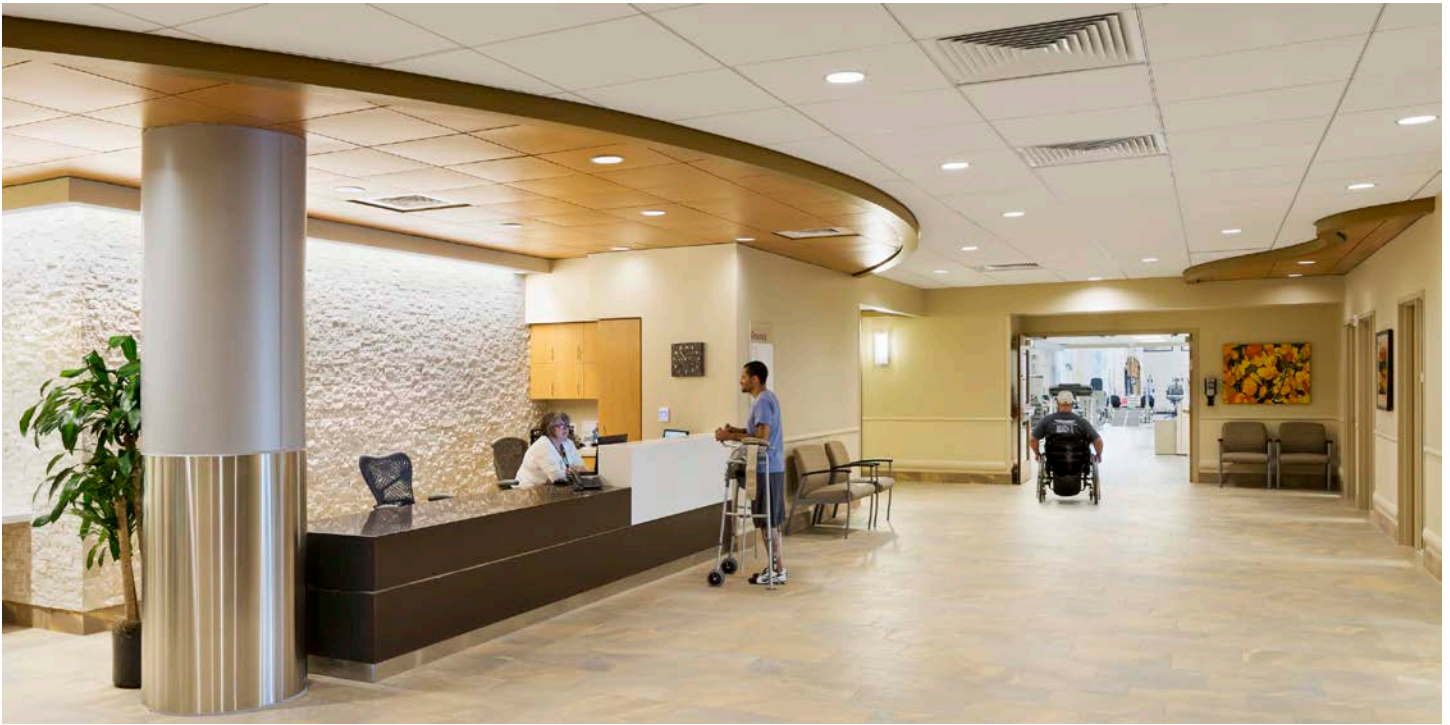
Caption: The use of natural tones, rich textiles and regionally-inspired artwork by RTA and SmithgroupJJR at Craig Hospital provides a balanced palette, while textured stone and colorful landscapes highlight key areas and wayfinding.