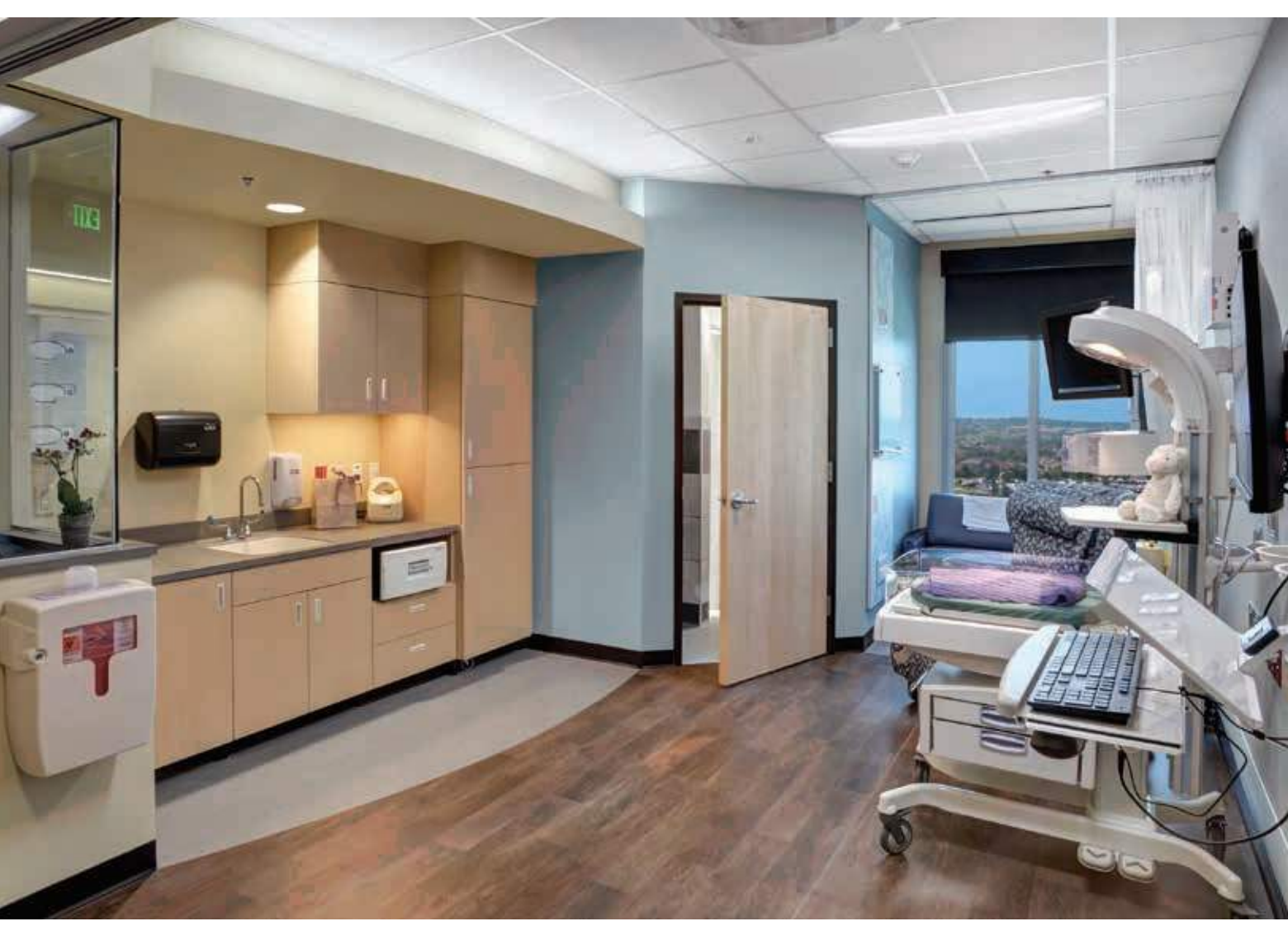
In stark contrast to a "typical" NICU where multiple babies are cared for in open wards, the St. Francis Medical Center NICU has 54 private single-family rooms, which encourage positive family interaction and parental overnight stays.

private room became the focus of the design for the expanded NICU. The singlefamily room encourages positive family interaction, parental overnight stays and privacy for kangaroo care (skin-to-skin holding). The Level III NICU at the St. Francis Medical Center now provides 54 single-family rooms.