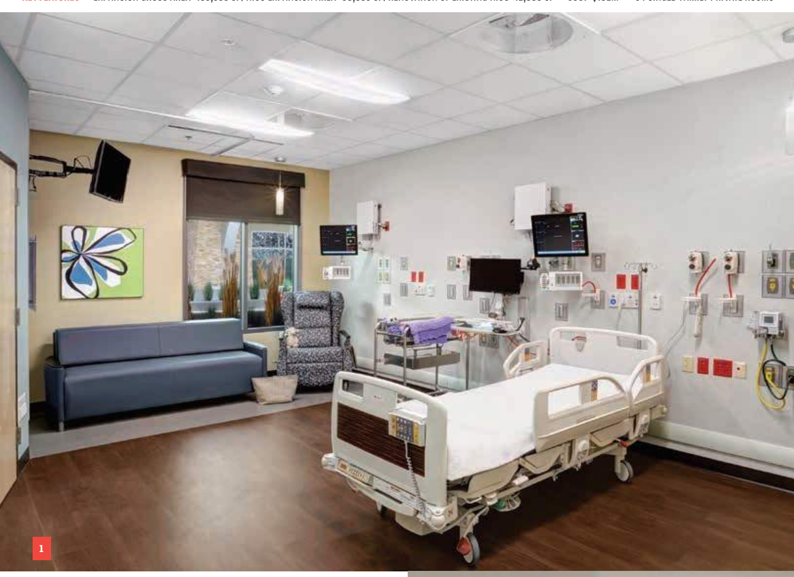
KEY FEATURES > EXPANSION GROSS AREA: 168,580 SF; NICU EXPANSION AREA: 30,668 SF; RENOVATION OF EXISTING NICU: 12,000 SF > COST: $102M > 54 SINGLE-FAMILY PRIVATE ROOMS

babies through a clinical team comprised of a wide variety of highly specialized staff. The four-year endeavor to expand and renovate the SFMC Level III NICU involved feedback and participation from all user groups of the department, as well as NICU "graduate" families.